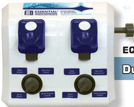
EQEMAX4X4 Dual-Dial 4P/4P