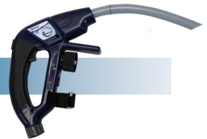
EQEMAXMB Mobile Unit 1P