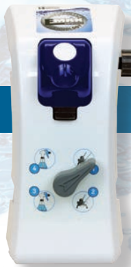
EQEMAX4 Single-Dial 4P

EMax dispensers deliver increased durability and easy, tool-free maintenance with compact profiles that can easily be mounted anywhere.