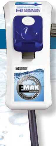
EQEMAX1 Single-Button 1P