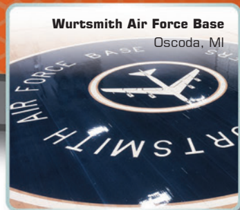
Wurtsmith Air Force Base Oscoda, MI