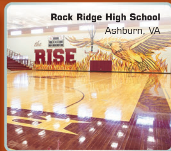
Rock Ridge High School Ashburn, VA