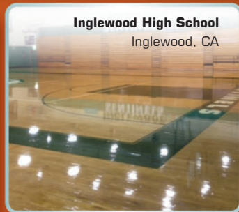
Inglewood High School Inglewood, CA