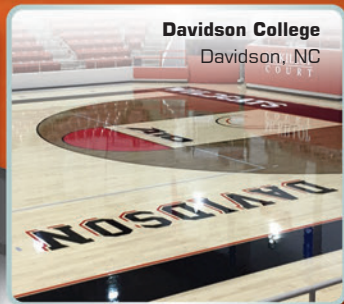
Davidson College Davidson, NC